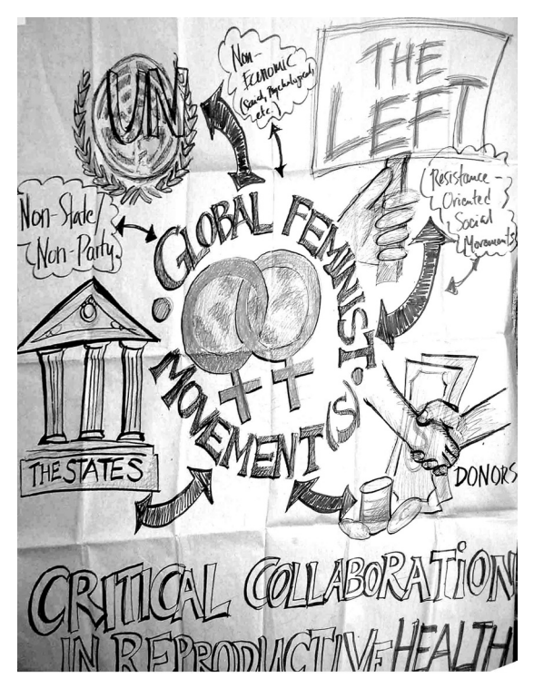
FIGURE 1. Global feminist movement(s) as it relates to the UN, the State, the Left, and Donors

During this second meeting, Isis International–Manila presented the output of the first round-table as a diagram of the relationship between the global feminist movement(s) and the four sectors—the UN, the State, the Left, and Donors—as follows: