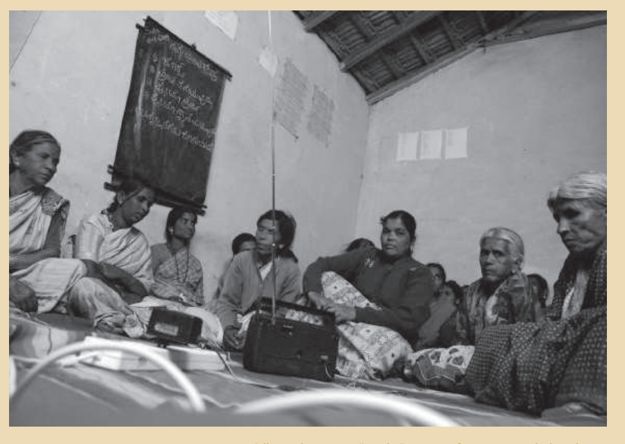
Collective listening at "sangha" meeting of community radio broadcast.