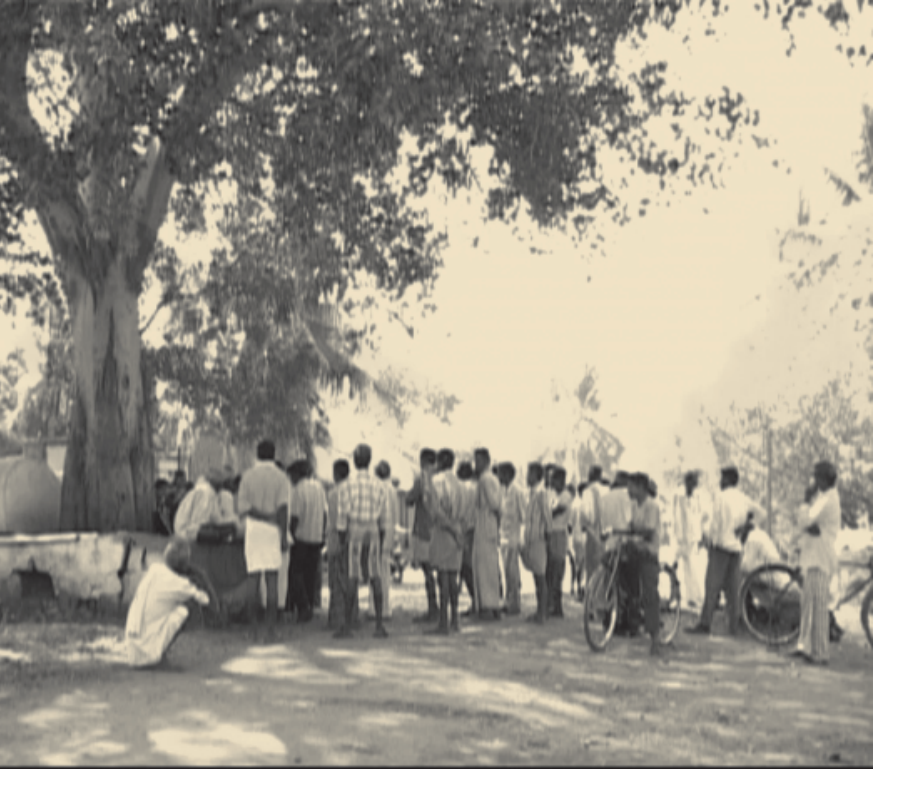
Village men gathered at a village shop to listen to a women's community radio programme.